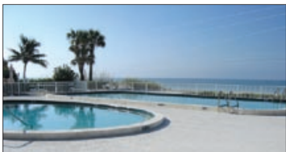
A Westchester Condominium recently sold for $750,000.